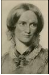
21 Charlotte Bronte